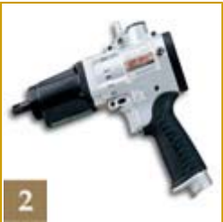
2 URYU DC Electric Pulse Tools