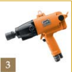
3 URYU Pneumatic Pulse Tools