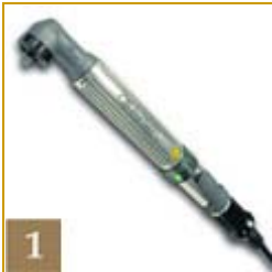
1 AcraDyne DC Electric Nutrunners