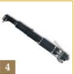
4 Pneumatic Nutrunners