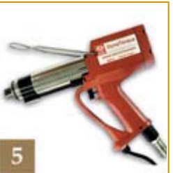
5 Swing-Bar Nutrunners