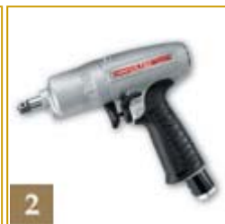
2 Omega and AcraPulse Pneumatic Pulse Tools