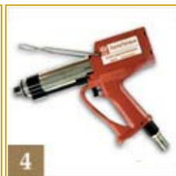
4 Swingbar Nutrunners