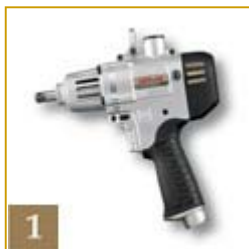
1 Omega Electric Pulse Tools