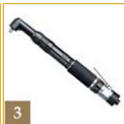
3 Pneumatic Nutrunners